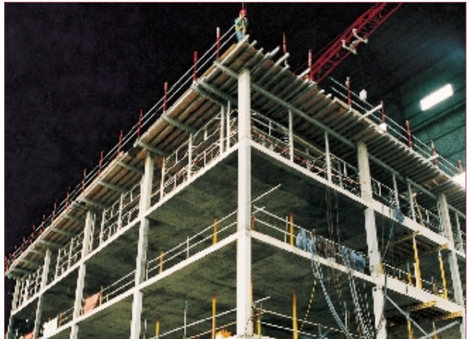
Figure 1: Table forms at Cardington

This Guide provides new and improved recommendations for striking formwork and gives new procedures for backpropping reinforced in-situ concrete flat slabs (less than 350 mm thick).